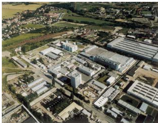
Leciva - Czech Main Production Facility – 120,000 SQM

Leciva, a.s. Pharmaceutical has high recording requirements to meet with regards to documenting every aspect of their production process to meet GMP (Good Manufacturing Practice) standards in their industry. Leciva, a.s. was the recipient of the first GMP Certificate in the Czech Republic, awarded by the State Institute for Control of Pharmaceuticals (government regulatory agency similar to the FDA in USA) in 1994. Thus they needed a system which provided extensive security measures, audit trails for operators, all production data to be logged reliably, operational sequence checking and traceable alarm and event history recordings to be retained. Therefore, Leciva, a.s. selected GENESIS32 Software, which met all their process documentation, production data collection and report requirements to meet their GMP standards.