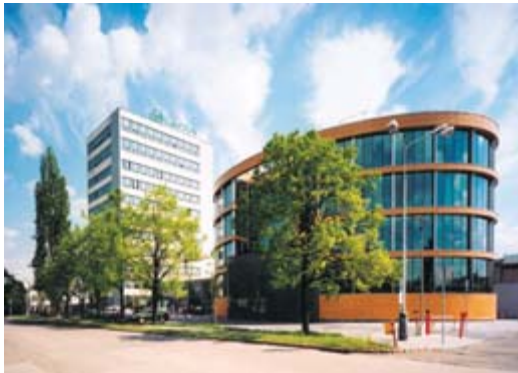
Leciva - Prague Headquarters

Leciva, a.s. Pharmaceutical is the largest Czech pharmaceutical company and dominates both the Czech and Slovak markets. Their main business is pharmaceutical production and distribution, including substances. Founded in 1993 under the Czech Republic National Enterprise and in 1997 the Czech government sold all the remaining shares it held to Leciva, a.s. They sell the majority of their pharmaceutical substances to developed industrial countries in the EU, Eastern Europe (Slovakia, Russia, Poland, Ukraine etc.). Leciva, a.s. dominates the local Czech Republic market with a 65% share of the production of this pharmaceutical substance sector.