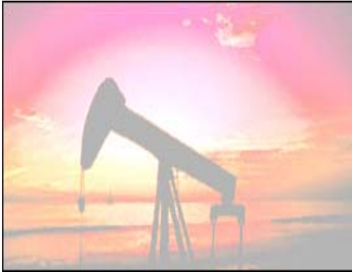
Large International Integrated Energy Company

A Large International Integrated Energy Company (LIIEC) with over $100 billion in annual revenue is a global energy enterprise developing vital energy resources in over 180 countries around the world and is a world leader in oil exploration and production. The USA ICONICS managed oil field has in excess of 3000 drilling wells that are using WebHMI software to monitor oil well performance, production analysis and maintenance operations.