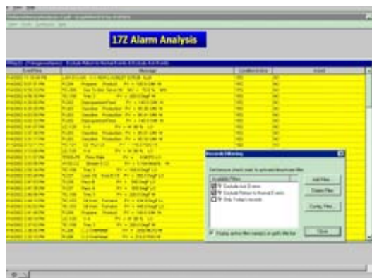
Alarm Summary Display