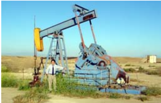
LIIEC Oil Rig Unit

LIIEC installed ICONICS GENESIS32 product suite of tools to deliver data from any LIIEC Business Unit facility, in the entire Western US area, to any user anywhere within the LIIEC Intranet. In the West Coast Business Unit there is a total of six major oil fields with numerous facilities controlled by Modicon and A-B PLC's. Genesis32 and WebHMI and various OPC Servers present the data from all of these systems to LIIEC users via the Web. A pilot system was installed at one of the LIIEC oil fields. There are currently 5 Genesis32 systems and 2 WebHMI Servers with 50 Client Licenses in use. Pocket Genesis and AlarmWorX32 Multimedia will be used to provide wireless access and notification for operators in the field. Approximately 15,000 I/O tags are monitored and controlled through these systems.