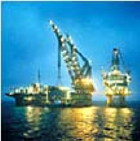
LIIEC Ocean Rig