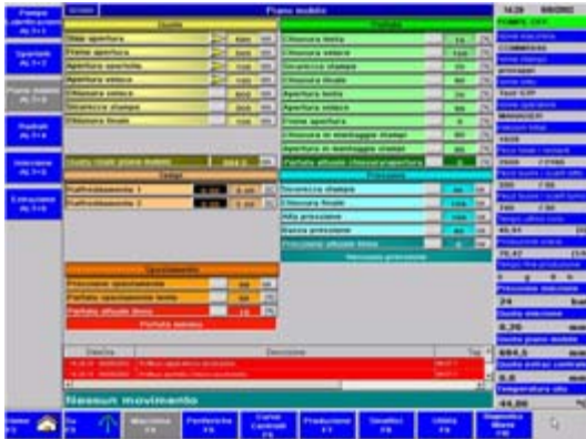
Press Statistical Data

ICONICS GENESIS32 software has been deployed to provide supervision and operator visualization about the metal injection press machines operations. The operator has the ability to set the machine parameters and to display critical real time information about the process. All the real time injection data from the press machine is collected and stored in a relational database. All collected data is available by graphic display that also includes Third Party ActiveX's data. IDRA also uses ICONICS TrendWorX32 to display and store process data. Each press machine is equipped with dual network interface cards, one for communicating collected real time data over their LAN to be stored into their database. The second network interface is used by the end customer to provide them with access of all the stored data on that press machine through an ODBC driver. A modem is also installed on the press machine for remote diagnostics and / or update modifications from IDRA. The press machine system interfaces with up to 4 Siemens PLC's, 1 Allen-Bradley PLC and has over 500 I/O points with 300 Tags. The complete installation was completed by IDRA over 18 months.