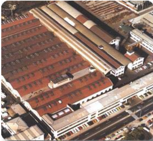
IDRA Press Plant – Italy