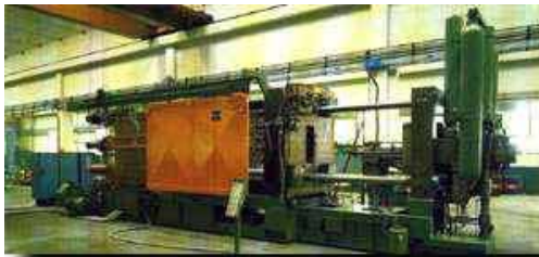
Pressure Die Casting Machine

IDRA Press is a leading producer of Pressure Die Casting Machines. IDRA manufactures large (20 to 5000 Ton clamping force) metal die casting machines which are shipped to clients worldwide. The market focus for IDRA is in automotive, where their machines are used to cast engine blocks, car body frames and other automotive parts for clients such as Mercedes-Benz, Ford, GM, Chrysler, VW, BMW, Fiat and many others. They also have casting customers such as Black & Decker, Electrolux, Siemens and Singer. Over 80% of their sales are in Europe.