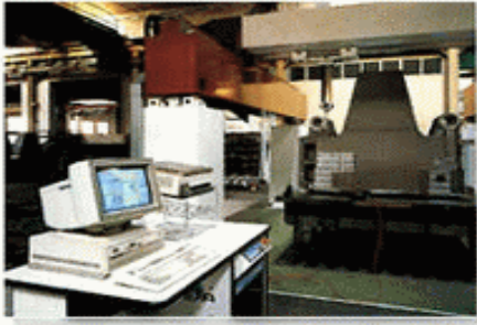
Press Quality Control Station